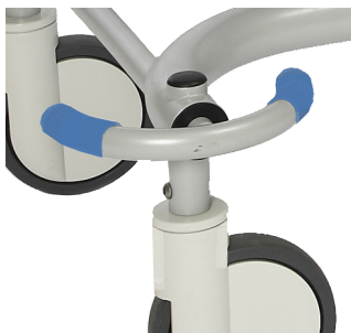
Paired braking and directional locking on low friction wheels.