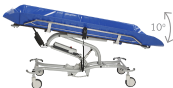
Tilt feature for comfort, positioning and drainage.