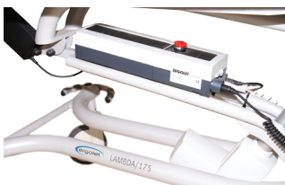
High capacity battery.